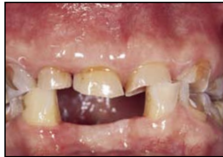
Figure A. Clinical example of severely worn dentition that results in a loss of vertical dimension of occlusion (VDO).