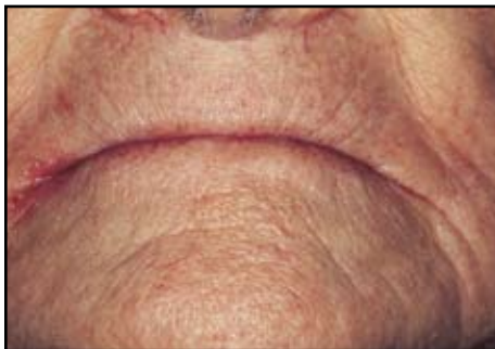
Figure B. Clinical view of patient who demonstrates signs of lost VDO. Note the down-turned lips when the patient is in closure.