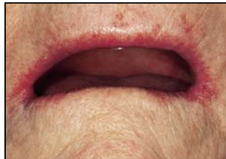
Figure C. Clinical appearance of angular cheilitis at the corner's of the patient's mouth, a sign of lost vertical dimension.