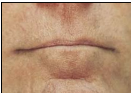
Figure D. Preoperative view of the patient demonstrates his vertically compressed appearance with his teeth closed.